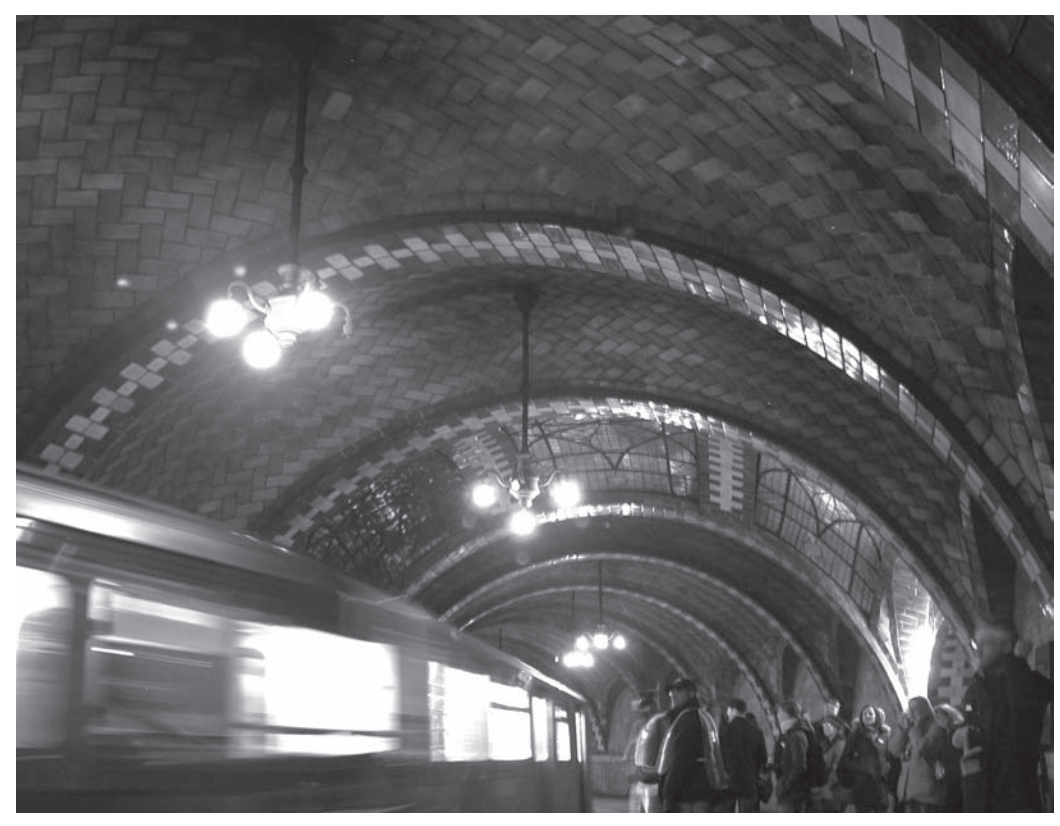
IRT City Hall Station

PA members marveled at the high level of detail invested in the station, designed by Heins & LaFarge, including Guastavino arches, colored glass tiles, and brass chandeliers. The station was the (see TOURS, p. 5)