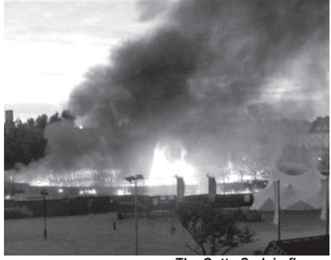
The Cutty Sark in flames

The ship, built in 1869 in Dumbarton, Scotland, has been dry-docked in Greenwich, London, since 1954. The gateway for the UNESCO World Heritage Site of Maritime Greenwich, the ship also houses the world's largest collection of figureheads.