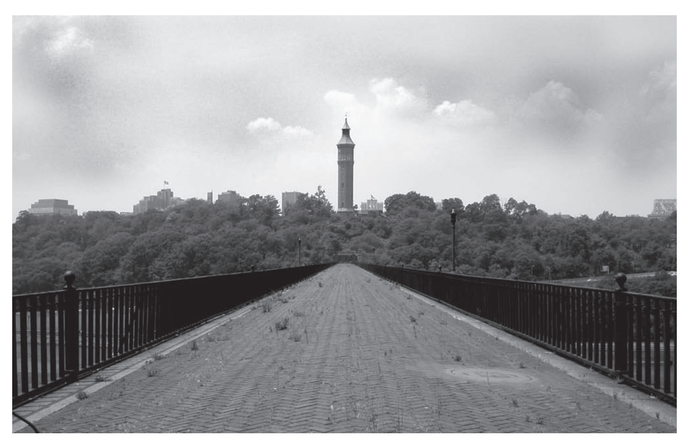
High Bridge and water tower