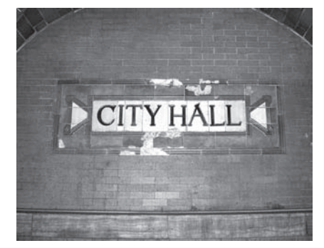
IRT City Hall Station name plaque

If you're not already a member, join now so that you can be included in our "members only" events in the future. Stay tuned for an announcement of our next event!