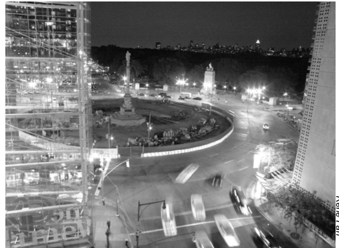
View of Columbus Circle from the balcony of Steelcase, with the new Time Warner building (left) and 2 Columbus Circle (right)